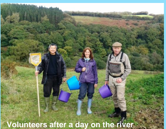
Volunteers after a day on the river

Interested? Call Patrick Watts-Mabbott on 01398 323665 / 07973727469 or visit http://www.exmoor-nationalpark.gov.uk/get-involved