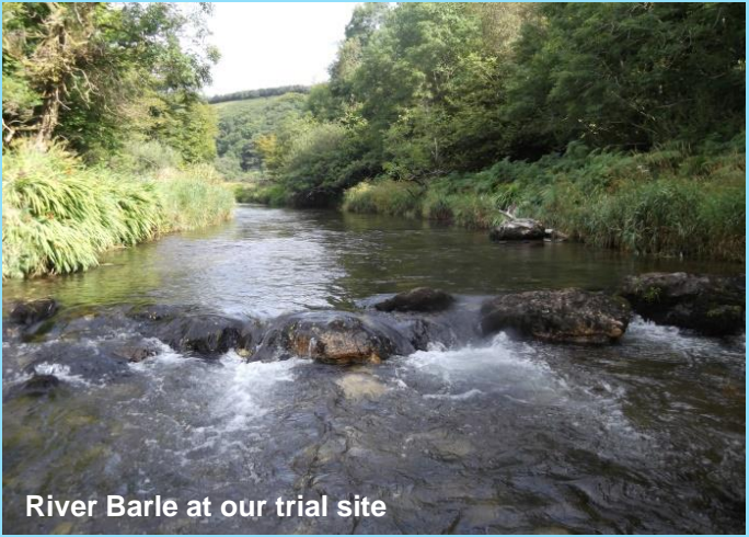
River Barle at our trial site

The signal crayfish Pacifastacus leniusculus is one of the most damaging invasive species both in the UK and worldwide. It has decimated native crayfish populations and can cause severe adverse effects on river ecosystems. In 2014 signal crayfish were found along a 10km stretch of the river Barle, posing a threat to the river's biodiversity, salmon fishery, Water Framework Directive & SSSI status.